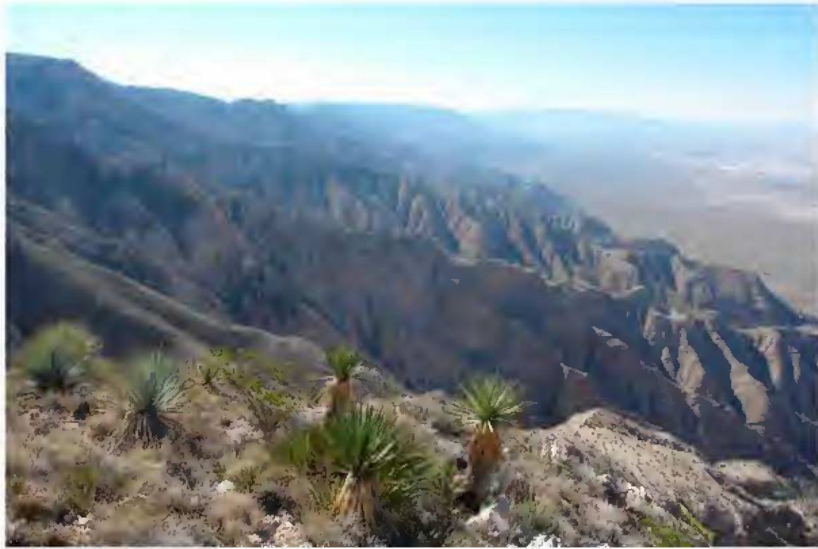
Fig. 4. Type locality of G. c. mikemoorei .